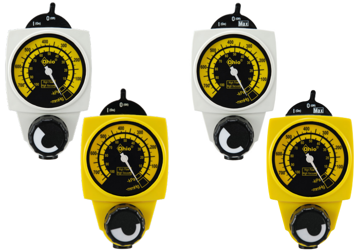
High Two Mode Continuous 5700 Series (White) 4700 Series (Yellow)