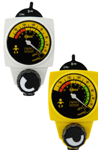
Low Two Mode Continuous 5700 Series (White) 4700 Series (Yellow)