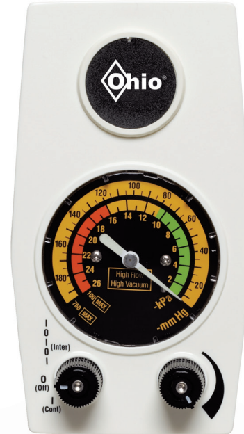
Intermittent Suction Unit (ISU)