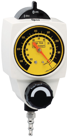
High Two Mode Continuous