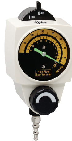
Low Two Mode Continuous