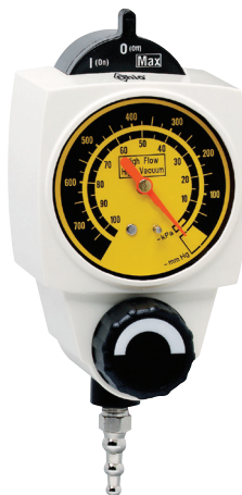
High Three Mode Continuous