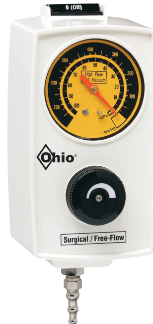
High Surgical/Free-Flow • 0-101.3 kPa gauge • 0-760 mm Hg gauge