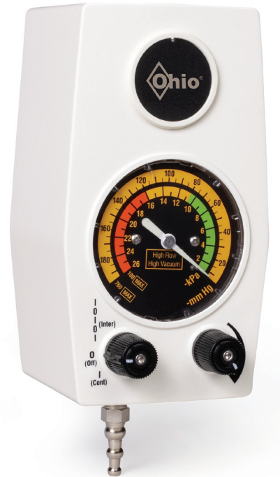
Adult Intermittent Suction Unit •0-200 mmHg •0-26 kPa