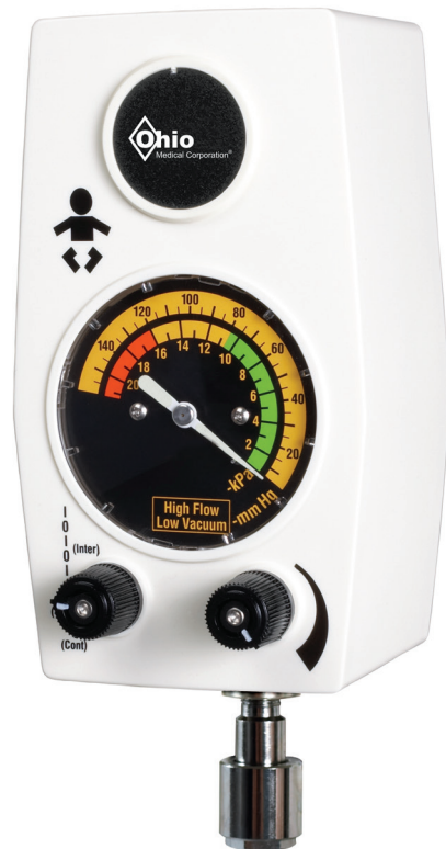
Pediatric Intermittent Suction Unit