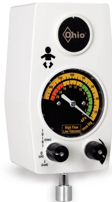
Pediatric Intermittent Suction Unit

The Pediatric Intermittent Suction Unit is a low vacuum/high flow regulator.