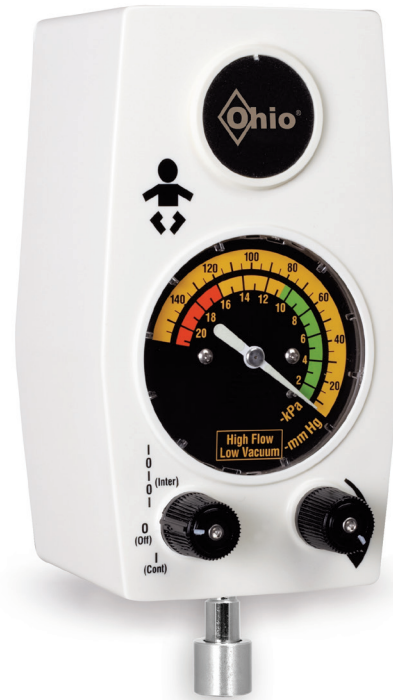
Pediatric Intermittent Suction Unit