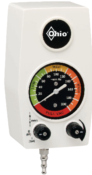
Adult Intermittent Suction Unit

The Intermittent Suction Unit is classified as a high vacuum/high flow regulator.