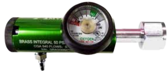
Click-Style Regulator with Nut & Nipple