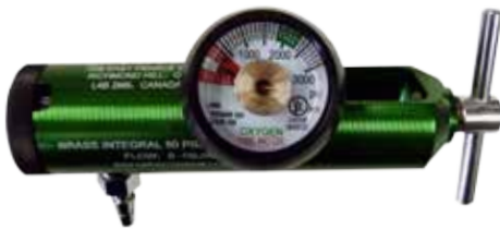
Click-Style Regulator with Yoke