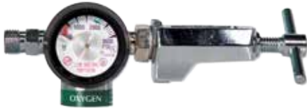
Compact Regulator with Yoke