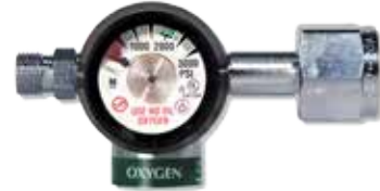
Compact Regulator with Nut & Nipple