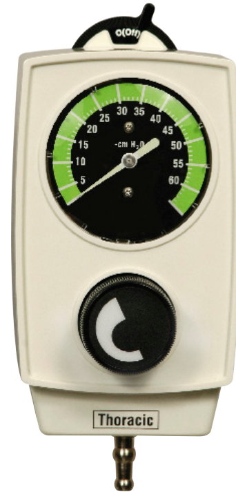
Thoracic Vacuum Regulator

The Thoracic Vacuum Regulator is available with adapters for virtually all pipeline systems and is offered with a standard tubing nipple or a locking gland for use with an Overflow Safety Trap.