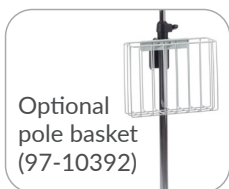
Optional pole basket (97-10392)