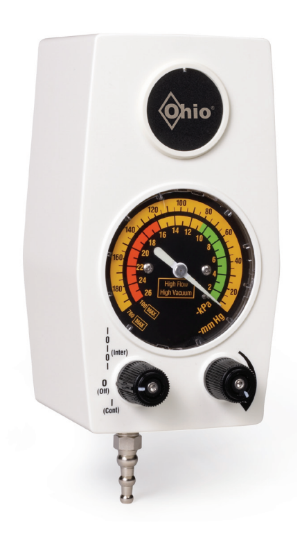
Adult Intermittent Suction Unit •0-200 mmHg •0-26 kPa

Few mechanical parts Rugged, shatter-resistant case